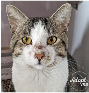
Dude came to HSWC as a stray