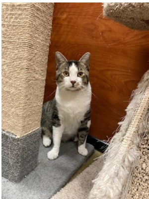
Dude looking quite dapper before leaving HSWC for his furever home

HSWC operations are currently incredibly limited by space and an outdated facility. A larger updated facility means better care for more animals.