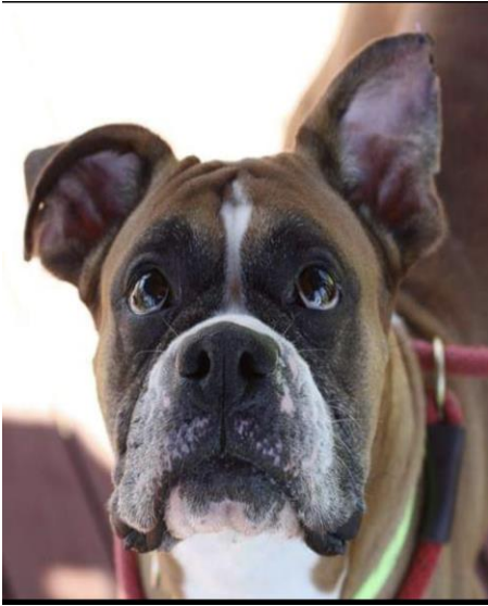
An alum of HSWC